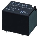
Wash tight 26.8×21.5×22.3